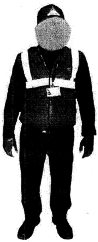
Uniform during winters (with safety jacket)