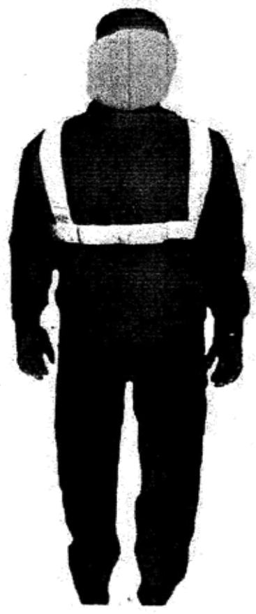
Uniform (from back side)